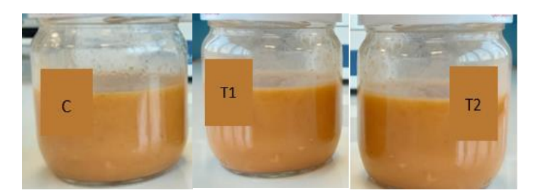
Figure 2. Control and TPIP added tarhana soups

According to the sensory analysis results, the highest texture, odor and general acceptability values (7.38; 7.50 and 7.50, respectively) were obtained in T1 while, these values (6.50, 7.13 and 7.13, in order) were the lowest in C (Figure 3). When the results were